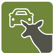
Wildlife- Vehicle Collisions