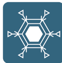
Winter Weather Related