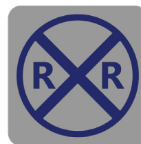
Highway- Rail Grade Crossings