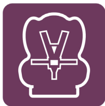
Children Passenger Safety (under 15)