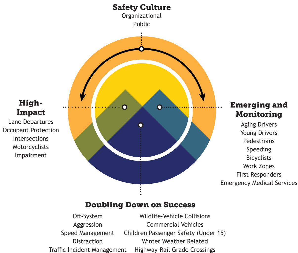
Figure ES-1: Focus Area Categorization